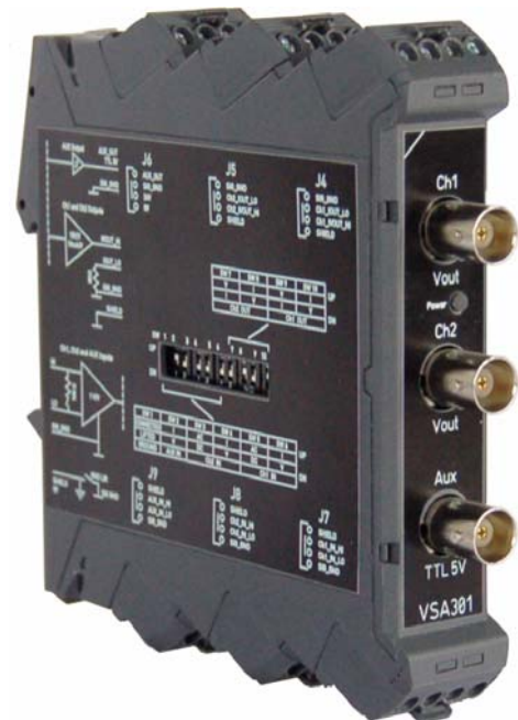
VSA301 buffered output amplifier